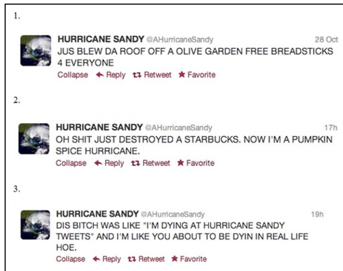
Figure 1. The three tweets posted from the twitter.com account @AHurricaneSandy on October 28, 2012, and October 29, 2012 used as stimuli.